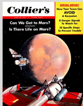
Above