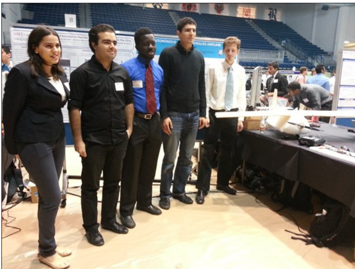
Above: Members of Team Aether.

The Tunisian students are electrical engineers and are providing the electronic avionics and propulsion aspects of the aircraft. They are also in charge of the website and media sharing that the ten-member team utilizes to keep in touch, as well as some of the virtual testing that was done with a model of the students' plane. Some of the underclassmen are members of the Rice AIAA student chapter. They are helping the team with design and build aspects, as well as making travel arrangements to help get the team to Arizona for the competition.