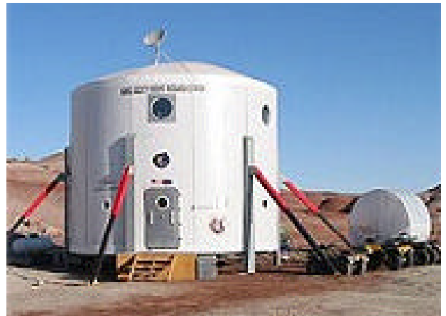
The Mars Desert Research Station in Utah.