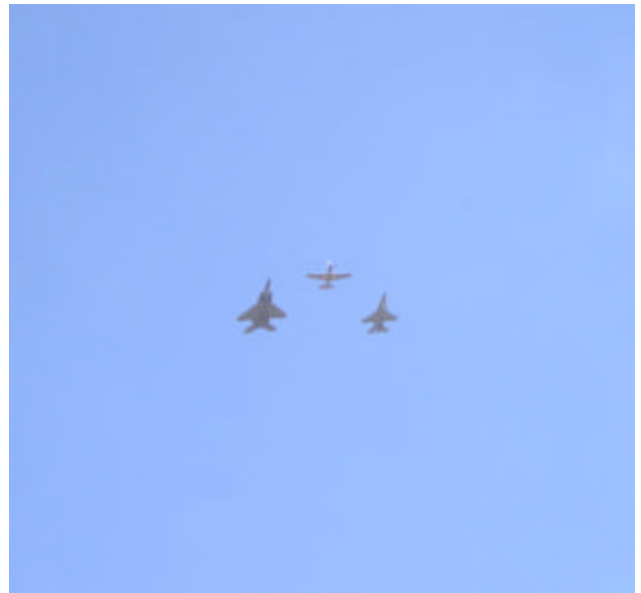
Wings Over Houston Heritage Fly Over. From left to right: F-15 Eagle, P-51 Mustang, F-16 Fighting Falcon.

Logo courtesy of www.wingsoverhouston.com