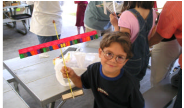
A proud student displays his final product