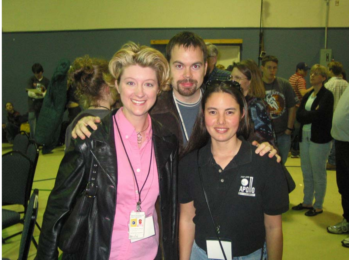
Executive Council Officers at the Mars Settlement Design Competition. See Page 6 for details