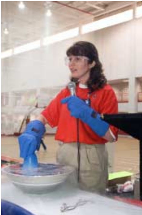
Joy Nitrogen