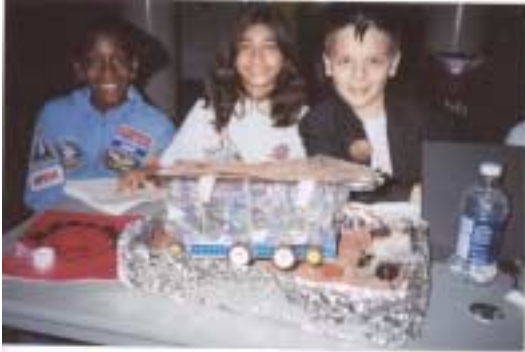
CCISD students pose with their Mars Rover at the Mars Rover Competition at the University of Houston