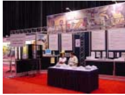
Ready for business