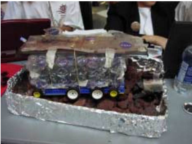
LaPorte NHLS Explorer 2002 1 st place elem