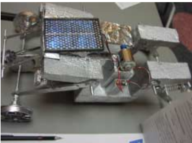
Sartartia Rover Detector 1 st I think

This one-day festival was dedicated to space pioneers of the future. Approximately 6,000 K-12 students came to the festival as part of field trips from schools all over Houston. The indoor/outdoor festival featured age-specific hands-on science and math learning activities such as design your own space station, Wright brothers’ gliders made from graham crackers, the vacuum of space, prism optics, inclined planes, alka seltzer rockets, tornados, gyroscopes, wind tunnels, Bernoulli’s principle, Van de Graaff generator, bubbles, liquid nitrogen demonstrations, angular momentum, TIVY space based math learning games, and videos.