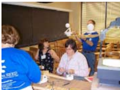
Teachers learning to build a planetarium model