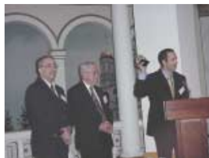
Education Time Capsule presentation to IAF and COSPAR