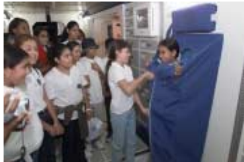
Where's my pillow, Picture me on the moon!