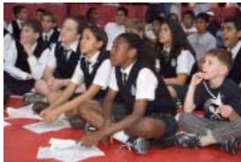
I hope my math was right