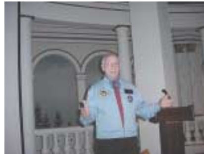
Former Astronaut Alan Bean