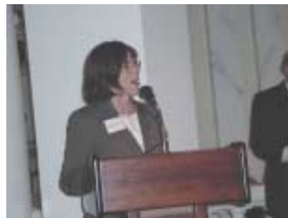
Teacher-in-space astronaut Barbara Morgan