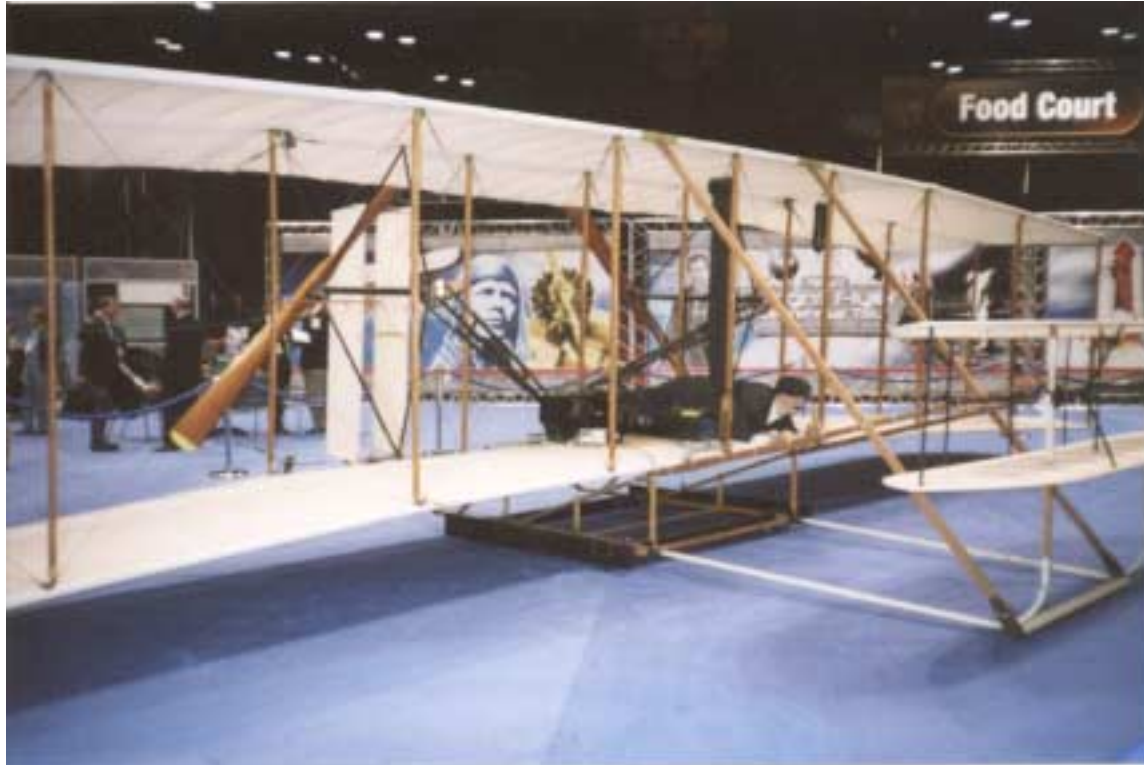
Wright Flyer at WSC. See details on page 13.