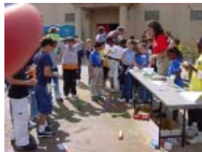
Alka seltzer rockets