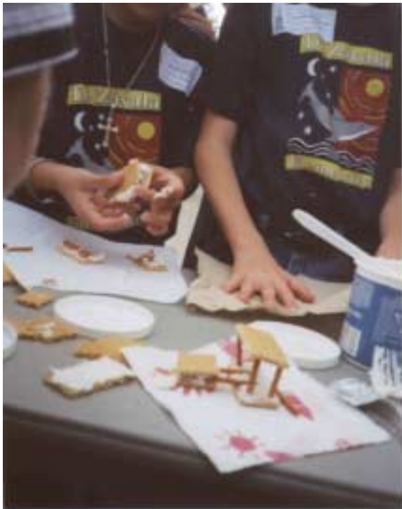
Students make planes and spacecraft out of graham crackers at the Space Rocks! Kids Festival