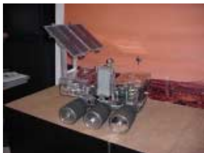
University of Houston Mars Rover