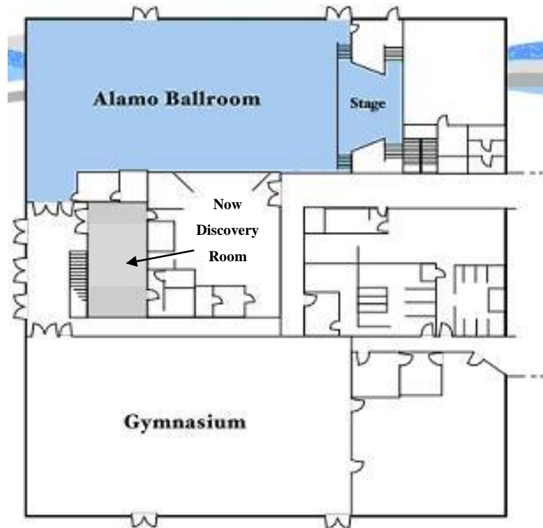
Figure 2. Gilruth Center First Floor