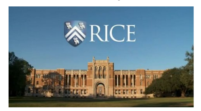
Above

The Tunisian students are electrical engineers and are providing the electronic avionics and propulsion aspects of the aircraft. They are also in charge of the website and media sharing that the tenmember team utilizes to keep in touch, as well as the some of the virtual testing that was done with a model of the students' plane. Some of the underclassmen are members of the Rice AIAA student chapter. They are helping the team with design and build aspects, as well as making travel arrangements to help get the team to Arizona for the competition.