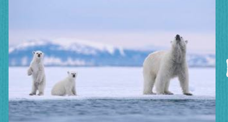
Svalbard Archipelago, Norway --- Polar Bear Mother and Cubs on Sea Ice

Arctic ice melt 'already affecting weather patterns where you live right now'