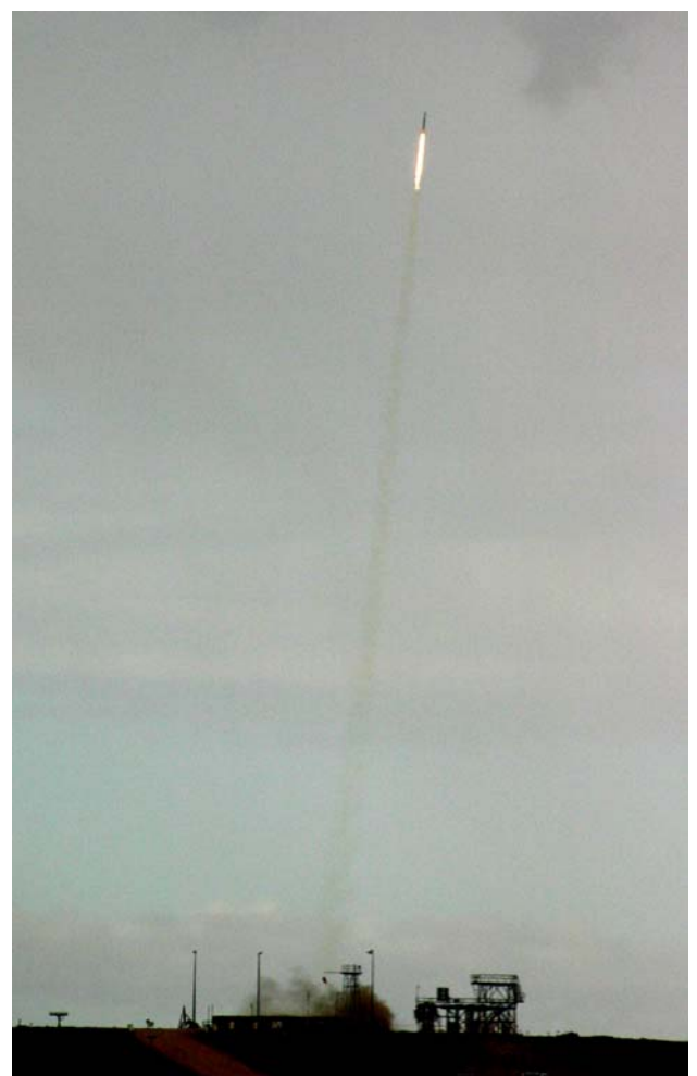
Zuni 1 launches on Aug 2, '04 reaching a maximum speed in excess of M2.0 and a height of over 7 km.